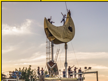
The famous moon is built and revealed at Casa Amarela