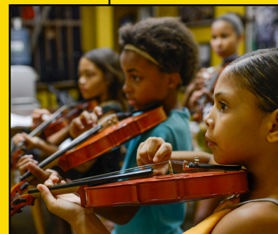
The Dance Company and Music Orchestra Programs are launched