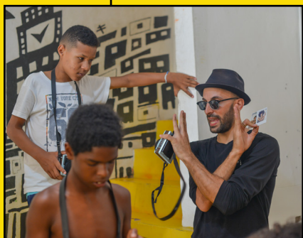
The Casa Amarela (Yellow House) opens its doors.