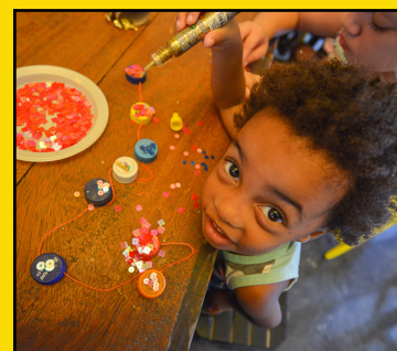
First children and teens programming is launched