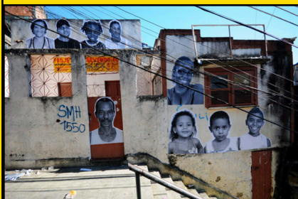
The first Inside Out Action at Morro da Providência